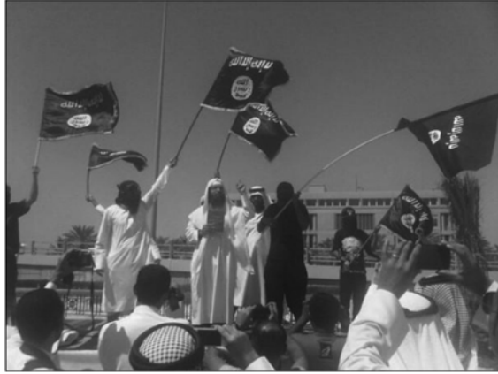
Protestors in Cairo, Egypt